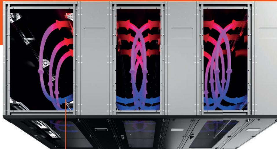
Air circulation inside the MCL