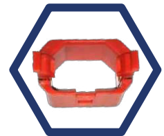
Patented standard C14 plug locking mechanism