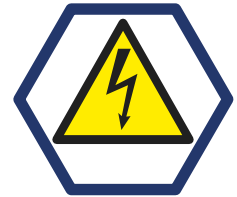
RCM Residual Current Monitoring Option