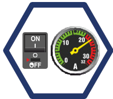
Hydraulic-magnetic Circuit Breakers monitoring