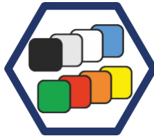
Full Color Range