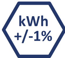
kWh Metering Accuracy