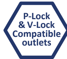
Secure Locking Outlets