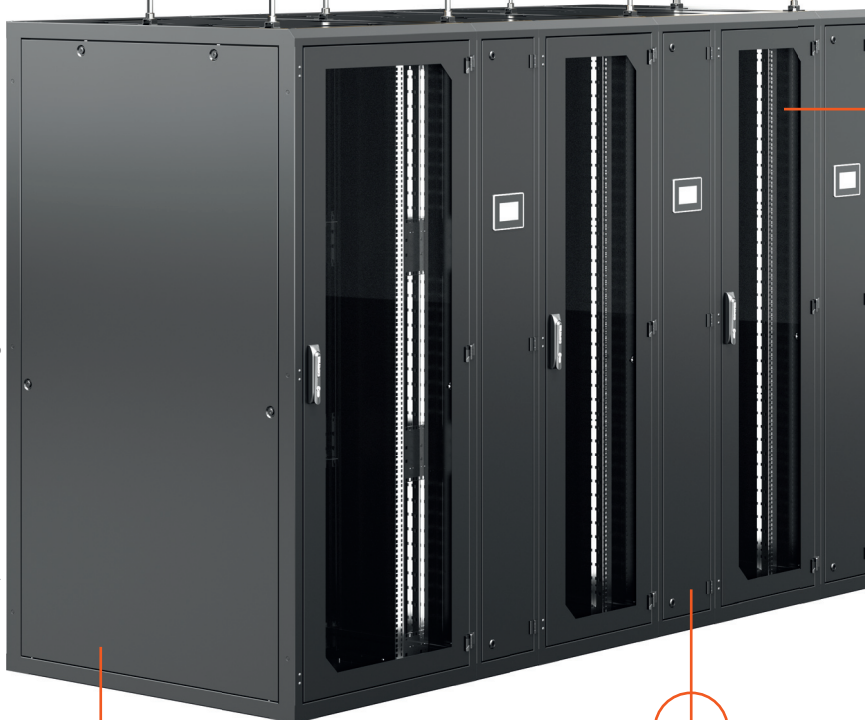
Illustration photo of 3 racks and 3 cooling units